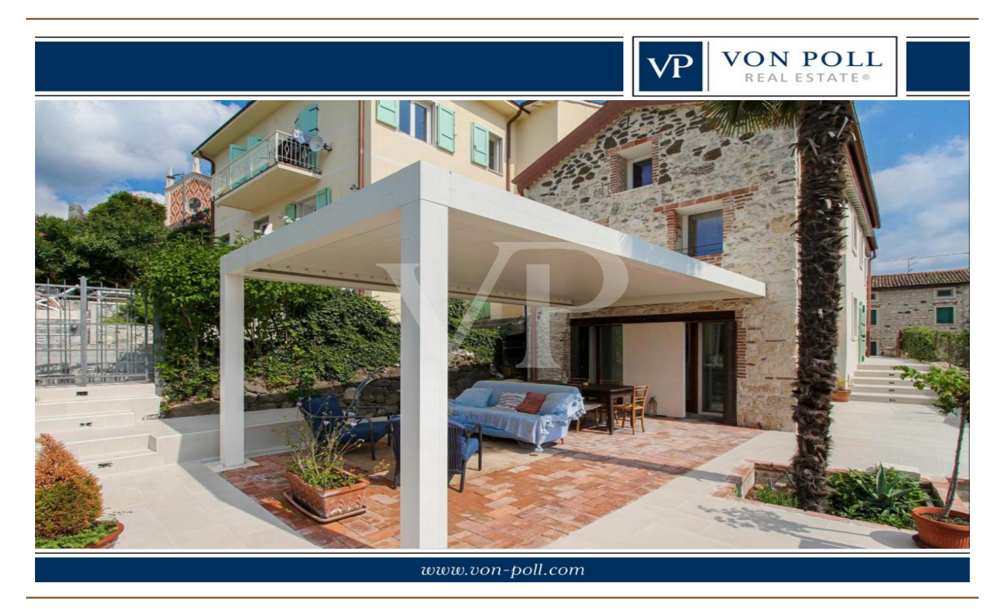
RENT PRICE: 2.300 EUR • LIVING SPACE: ca. 141 m<sup>2</sup> • ROOMS: 7